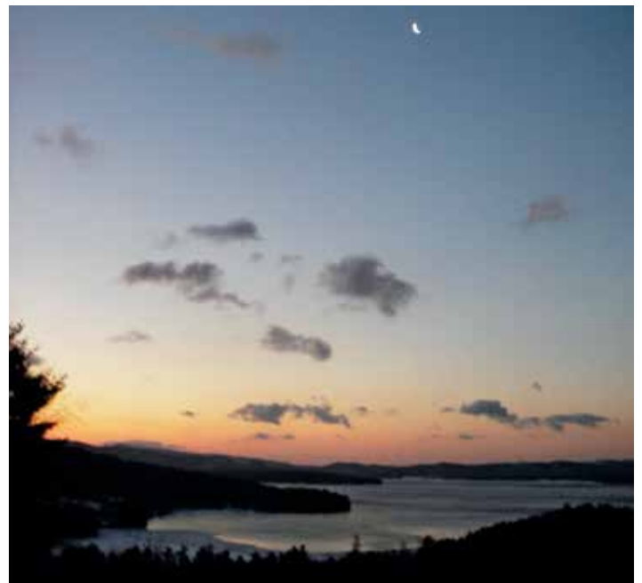
View of Newfound Lake from the North

woodlands and wetlands and valuable wildlife habitat along the Cockermonth River at the head of Newfound Lake, abutting additional conserved land, and providing excellent opportunities for nature education and enjoyment of Newfound’s natural beauty. In addition, with the support of the Gemmill Fund and the NLCP, the Forest Society has completed three significant projects — the 486-acre Butman Conservation Easement in Alexandria, the 275-acre Hazelton Farm Conservation Easement in Hebron, and the 146-acre Caperton Conservation Easement also in Hebron.