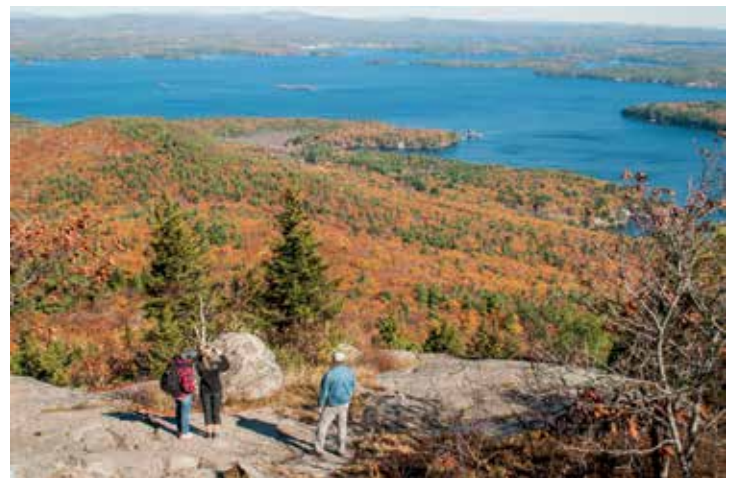
Guided Hike on Mt. Major (Above) View of the Belknap Range from LRCT's Rattlesnake Island Preserve (Masthead)

Thank you to all who supported the "Everybody Hikes Mt. Major" campaign. Your generosity makes it possible for the Lakes Region Conservation Trust, the Forest Society, and our partners to conserve and steward these key Belknaps parcels and lays the foundation for future conservation achievements in the Belknap Range.