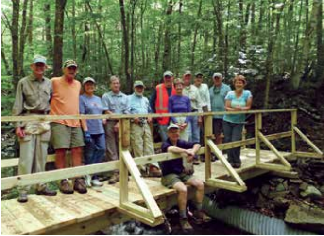
Bridge Crew at Castle in the Clouds

All that we do at the Lakes Region Conservation Trust would not be possible without the extraordinary volunteers that we are so fortunate to have on our team. The activities of these people include service on our Board of Trustees and Committees, stewardship of conserved lands and trails by property adopters, trail adopters, and other stewardship volunteers, the essential regular monitoring of conservation easements, leading and assisting on our guided excursions, help with mailings and other administrative tasks, work on land conservation projects, help with fundraising, representing LRCT at local gatherings and events, and serving as LRCT's eyes and ears out on our properties.