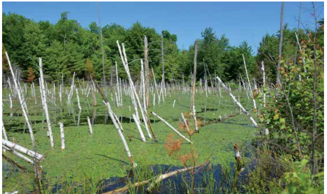
Fogg Hill Wetland

Read more about kettle hole bogs at www.nhdfi.org .