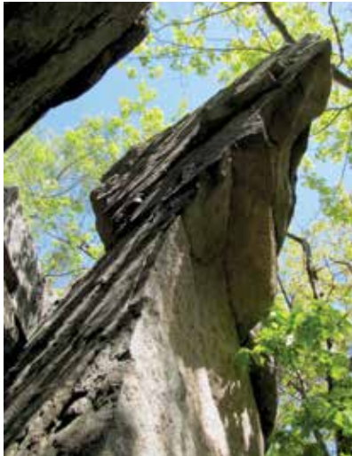
Anvil Rock on the Piper Mountain — Moulton Valley Property

and rare plant communities, and valuable wildlife habitat. They also contribute to the protection of the water quality of Lake Winnepesaukee and other nearby lakes and rivers, and they add significantly to the lands already conserved in the huge unfragmented forest block in the Belknaps.