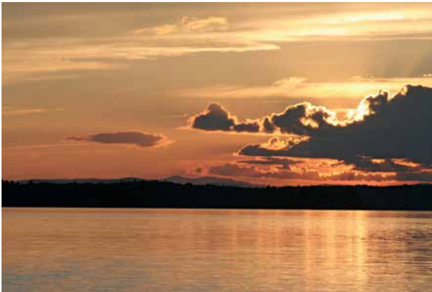
View of Lake Winnepesaukee

We expect that partnering with others will help projects happen more quickly and will make them better, but what we don't always anticipate is how much it contributes to LRCT. Long after finishing a project, we realize that the relationships we have forged while working on it continue to benefit LRCT — they enhance our character, expand our perspective, and help us become an even better organization.