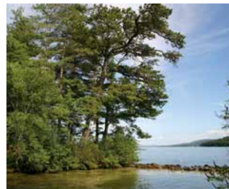
Stonedam Island

If you are interested in supporting the Stonedam stewardship effort, please let us know. We will keep you posted on the progress on this project.