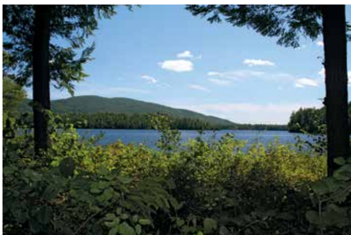
View of Squam Lake From Jimmy Point